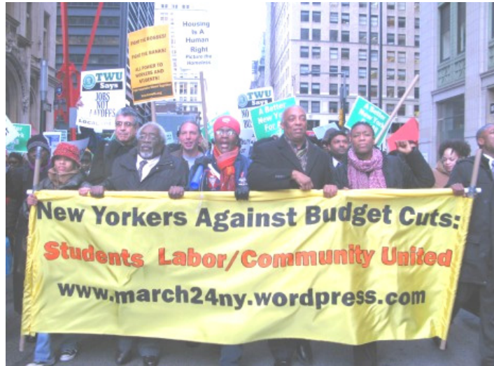
March from City Hall to Wall Street: March 24, 2011