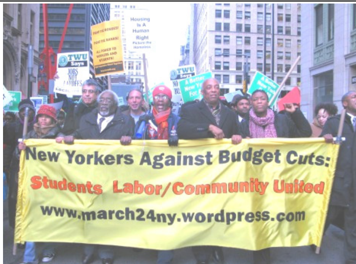
March from City Hall to Wall Street: March 24, 2011